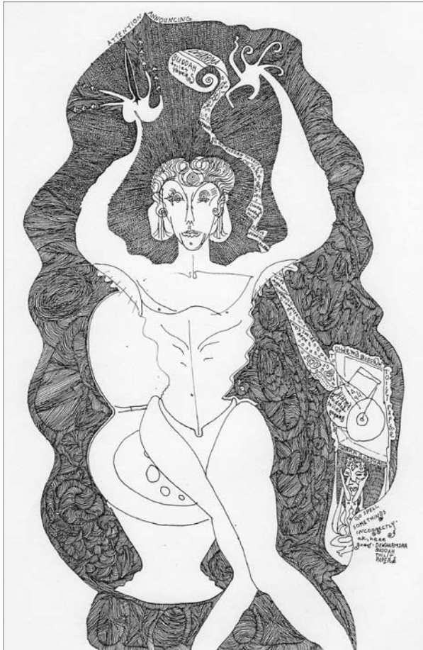
(left) Stephen Varble, untitled drawing (“Dharma Buddha” Toilet Paper), c.1982. Ink on paper.