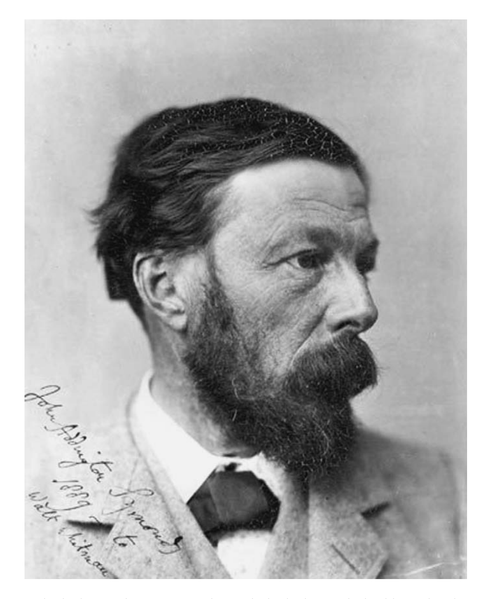
Figure 1. Photograph of John Addington Symonds, inscribed to Walt Whitman, 1889.

embodied exemplar or avatar – that is, the body that can be legibly read as the manifestation of an ideal or set of ideals. Symonds was quick to note that no one body can readily fulfil this expectation, and the artist is forced to adapt or to construct a figure to achieve the requisite bodily signs of ideality. The intersection between the exemplary and the bodily in such corporeal investitures, he argued, necessarily entails a compromise between Realism – that is, recognizable elements drawn from the perceived natural world, and Idealism – the higher concepts the artist hopes to convey. For Symonds, the accommodation of the 'twin-born factors' of the Real and the Ideal in a single object served as one of the central aims of art.<sup>10</sup>