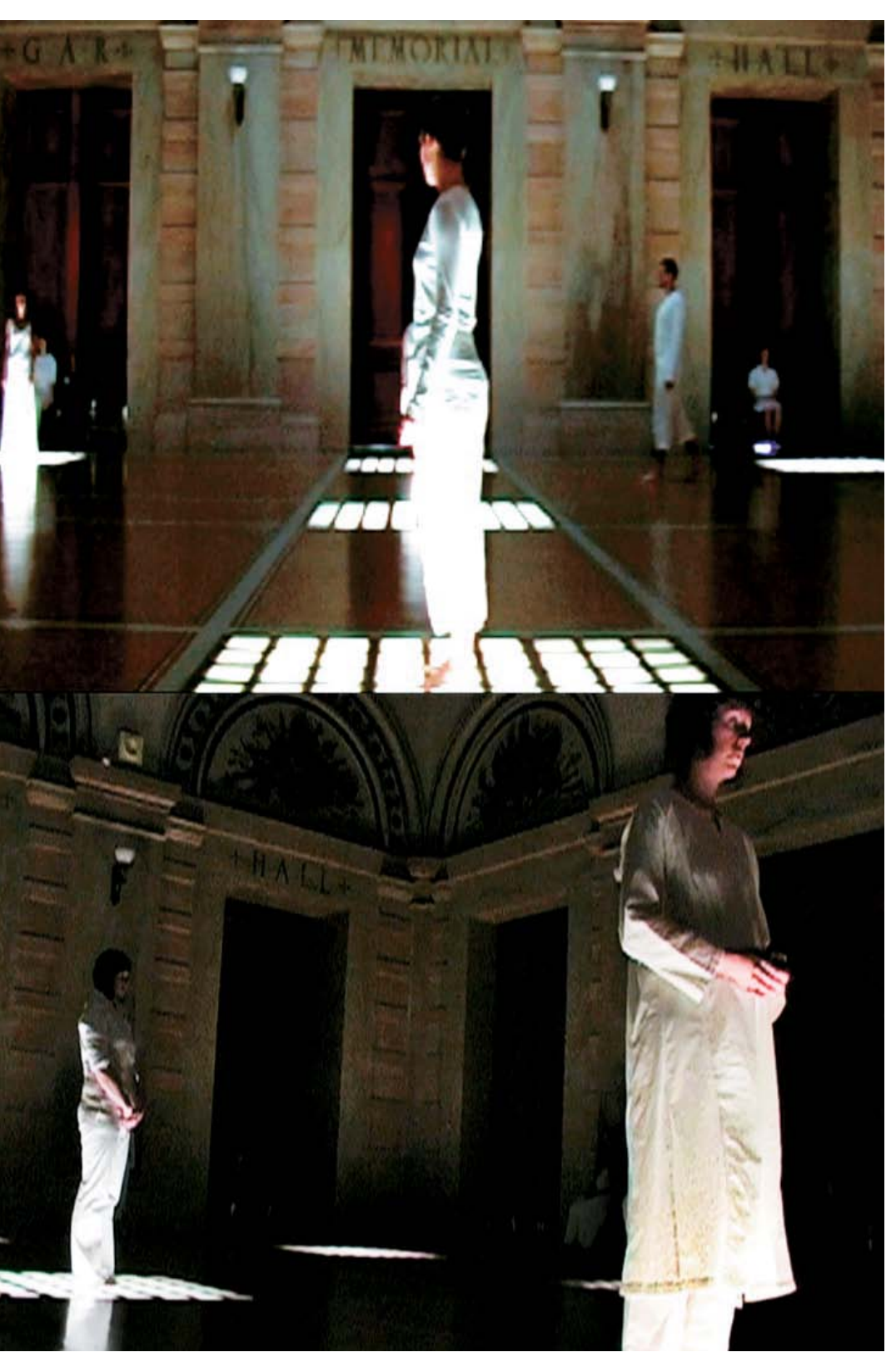
Stills from video documentation of Memorial Gestures.