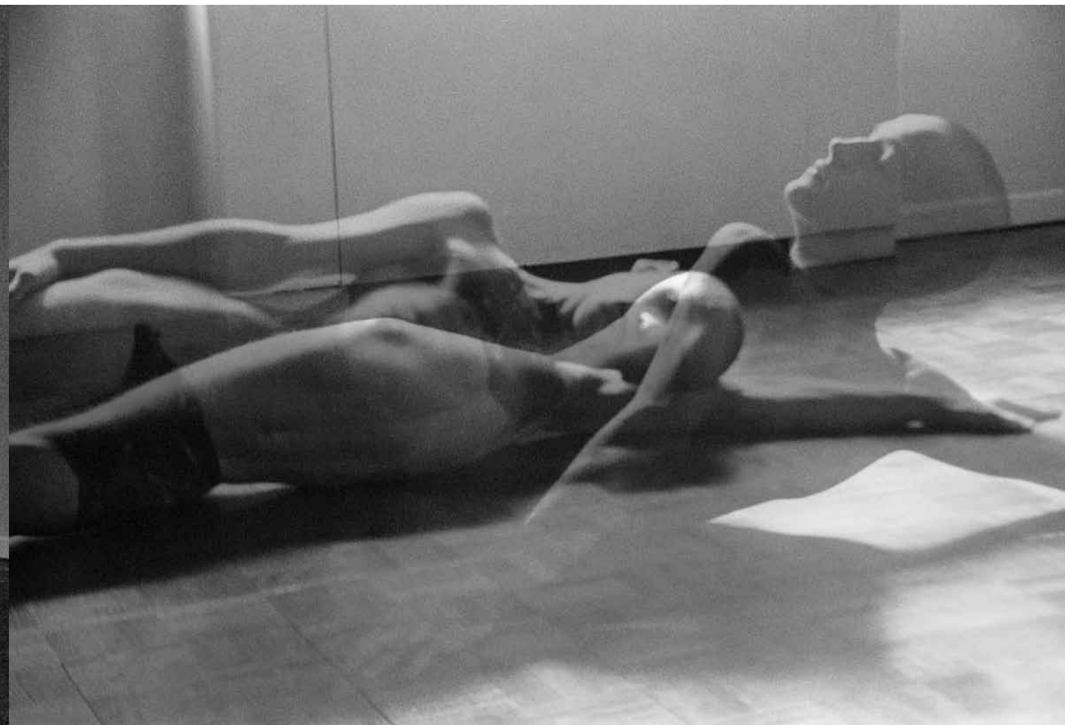
Untitled, 1998 archival inkjet print 20 x 24 inches