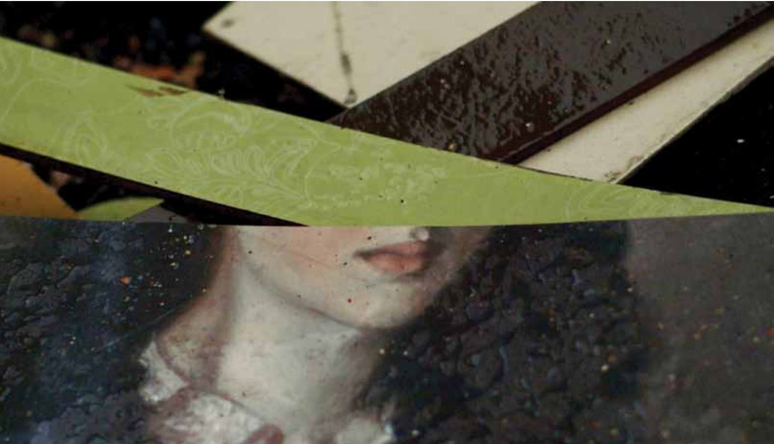
Video still from Deseos / تاب‌غیر , 2015 HD 16:9, video, color, sound 32'37"