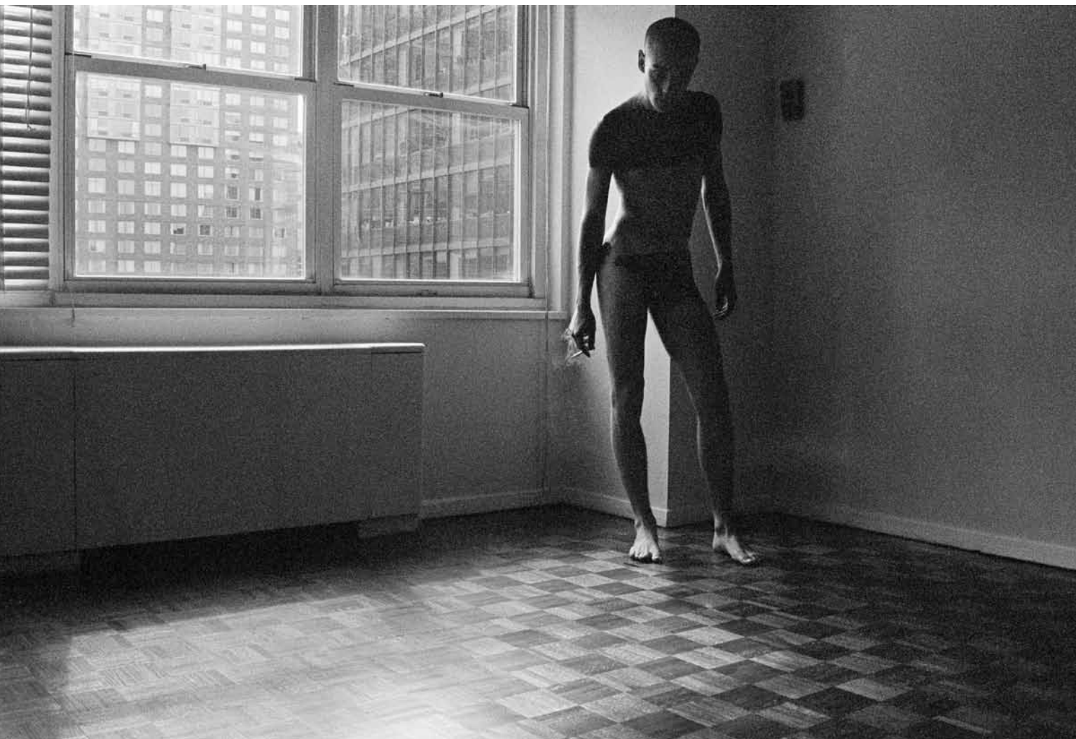
Untitled, 1998 archival inkjet print 20 x 24 inches