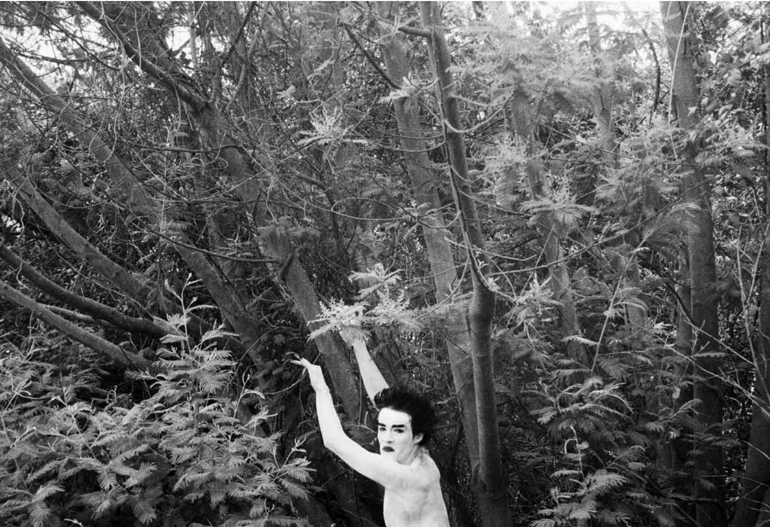
Untitled, 1998 archival inkjet print 30 x 45 inches