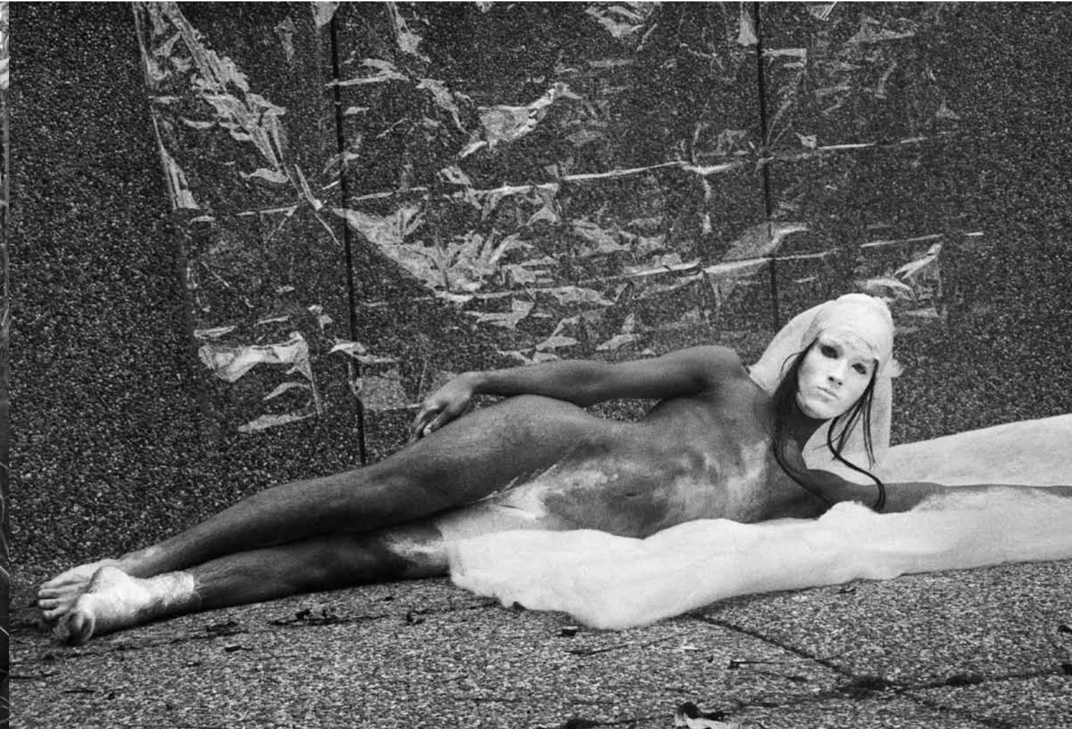
Untitled, 1998 archival inkjet print 30 x 45 inches