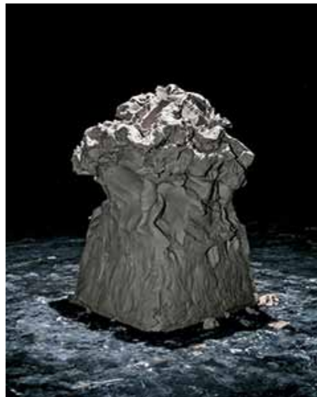
140 Heather Cassils, Before from the performance Becoming an Image , 2012–present. (This version: 35th Rhubarb Festival, Buddies in Bad Times Theatre, Toronto, 2014.) EM-217 (WED) modeling clay, 907 kg (2000 lbs), 129.5 × 91.4 × 91.4 cm (51 × 36 × 36 in.).