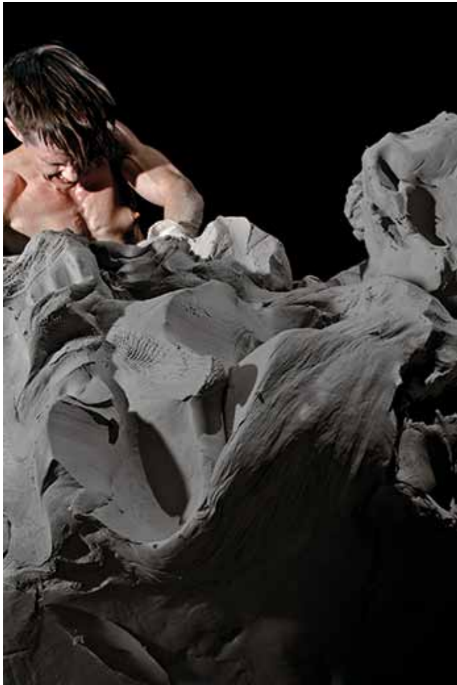
143 Heather Cassils, Becoming an Image, Performance Still No. 2 , 2013, from Edgy Woman Festival, Montreal. C-print, 91.5 × 61 cm (36 × 24 in.).

form – which Cassils referred to once in conversation as “Juddian,” thus signaling its citation of Minimalism’s activation of bodily relations. 4