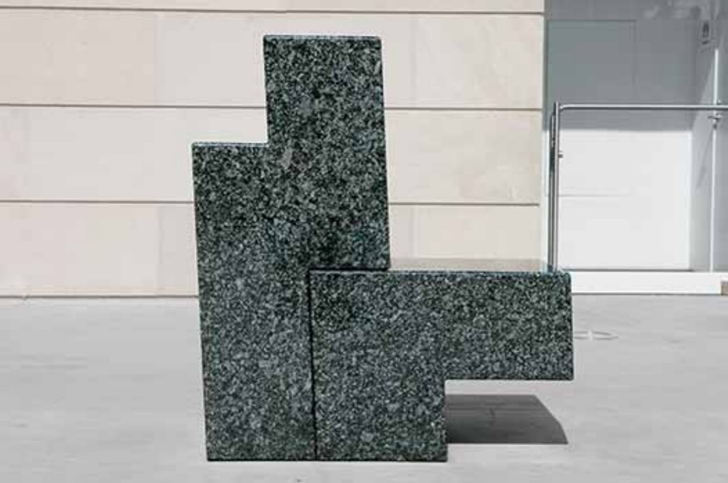
144 Scott Burton, Two-part Chair , 1986. Lake Superior Green Granite, 101.6 × 58.4 × 91.4 cm (40 × 23 × 36 in.). Installation view, Art Institute of Chicago.

ing a sculptor in the 1970s, he boldly sought to make work that demanded plural accounts of personhood. This same increasing embrace of expansiveness can be seen in such artists as Grossman, Chamberlain, and Flavin as they developed their work in the 1970s to afford more mobile and multiple ways in which bodily metaphors, names, and genders could be located in their practices. Their work, that is, proposed unforclosed accounts of “what a person is.”