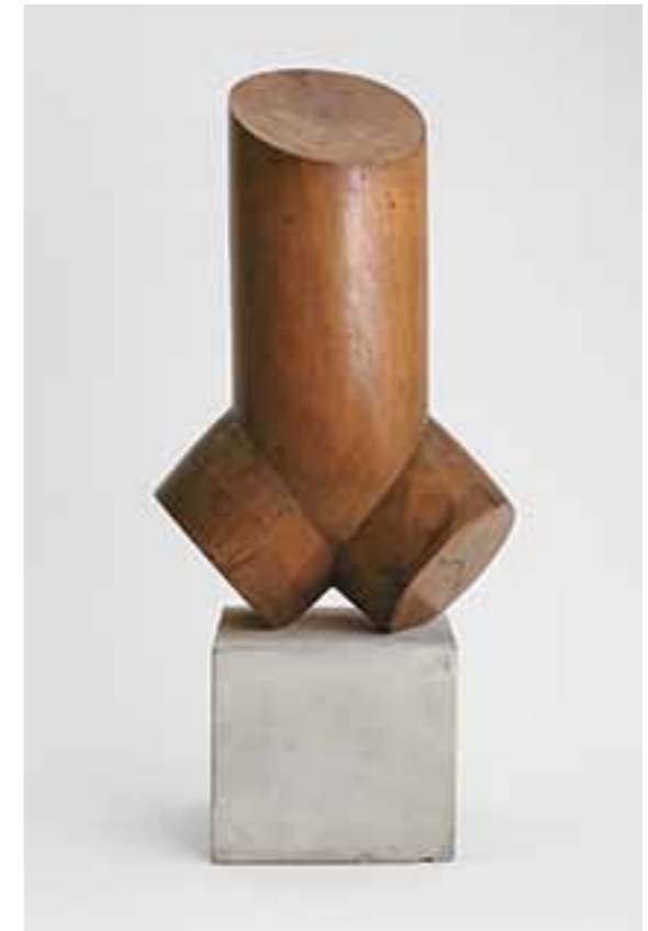
4 Constantin Brancusi, Torso of a Young Man [II] , 1917–22. Maple on limestone block, 48.3 × 31.5 × 18.5 cm (19 × 12 3 / 8 × 7 3 / 8 in.) on 21.5 cm (8 3 / 8 in.) base.

In doubling, confounding, and fusing the markers of sexual identity, Brancusi breached the imposed rigidity of the gender divide and conjured the vision of an inclusive, nonhierarchical sexuality. By destabilizing