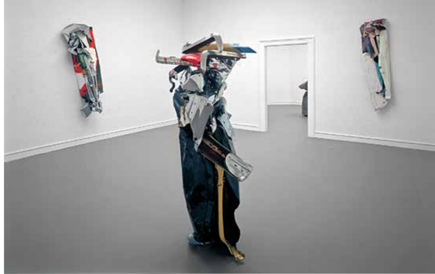
2 John Chamberlain, Flavin Flats , 1977. Painted and chromium-plated steel, 195.5 × 95.5 × 94 cm (77 × 37½ × 37 in.). Installed at Staatliche Kunsthalle Baden-Baden, 1991, in foreground.

Fluorescent tubes, welded steel planes and cubes, and discarded autobody parts or leather garments – these are the materials used by Flavin, Smith, Chamberlain, and Grossman in their pursuit of abstract sculptural objects. Despite their aim to refuse or befuddle reference and signification, they