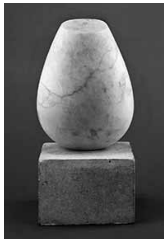
5 Constantin Brancusi, Torso of a Young Girl [II] , c. 1923. White marble on limestone block, 34.9 × 24.8 × 15.2 cm (13 3 / 4 × 9 3 / 4 × 6 in.) on 15.6 × 22.9 × 22.5 cm (6 1 / 8 × 9 × 8 3 / 4 in.) base.

ment. Thus, despite the availability of Torso of a Young Man to readings of it as female or phallic, Brancusi reminded us that it was a young man. Princess X's conflation of female portrait and phallic shape operates as a joke (as the story goes, on the sitter) or, at best, as an oscillation between two opposed readings. Despite the volleying of gender in his works depicting humans, they ultimately relied on binary definitions and domesticated ambiguity. More complex and mobile forms of genders were left for the birds.