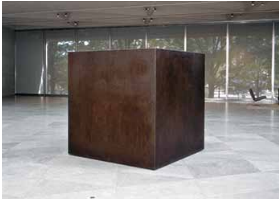
3 Tony Smith, Die , 1962 (fabricated 1968). Steel with oiled finish, 182.9 × 182.9 × 182.9 cm (72 × 72 × 72 in.). National Gallery of Art, Washington, D.C.; gift of the Collectors Committee 2003.77.1.

was making might be something like a surrogate person – that is, a kind of statue .” 19 Recalling the ways in which Clement Greenberg elided the sculptural with the figurative, Fried cast the literalist object as a “statue” in order to show how its lack of resemblance to the human form nevertheless prompted the projection of the human onto it. 20 He quipped, “I am suggesting, then, that a kind of latent or hidden naturalism, indeed anthropomorphism, lies at the core of literalist theory and practice. The concept of presence all but says as much.” 21